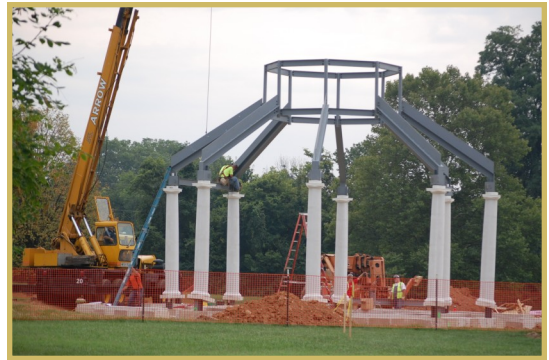
Columns were erected August 3, 2010