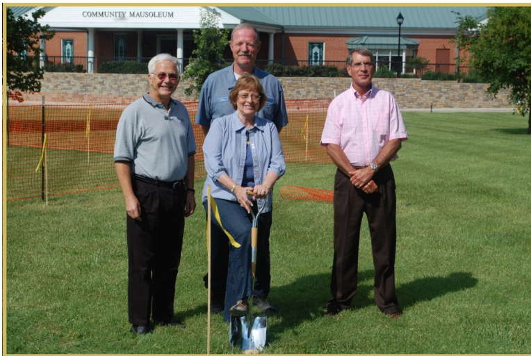
Groundbreaking June 29, 2010

David's Columbarium is a monumental structure that is located near the center of our newest upright monument burial section, Section "G", and will help identify this part of the cemetery. It will provide a final resting place for 704 loved ones in the cremation niches and provide shelter from inclement weather to visitors attending funeral services and visits to the niche area. The architectural details, materials and colors are taken directly from other buildings in the cemetery giving your cemetery a unified appearance. Completion is expected by late fall 2010. Please contact Eric Watne, Assistant Cemetery Superintendent, to be placed on an interest list at 937-434-2255 or Eric@davidscemetery.com .